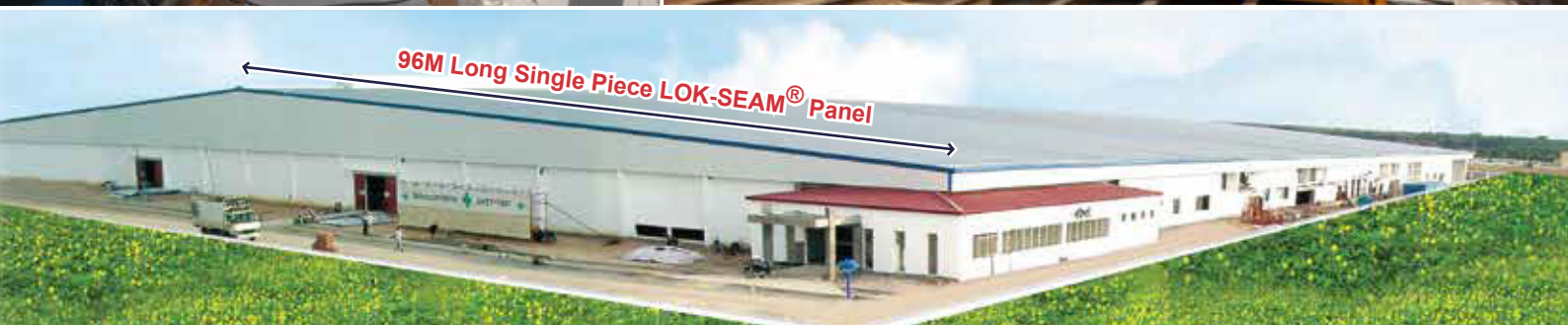
96M Long Single Piece LOK-SEAM® Panel