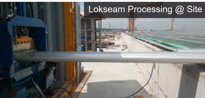
Lokseam Processing @ Site